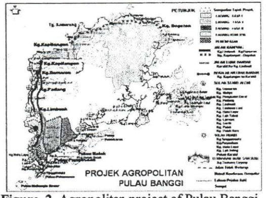
Figure 2. Agropolitan project of Pulau Banggi, Sabah

From the economic aspect, the effort to develop an area about 4000 hectares of the farm conducted for 1000 participants. In addition, fish farming for 20 permanent employees with an area of 499 hectares. Other economies are also undertaken such as tourism, small and medium industries, boats manufacturing and other. From the infrastructure aspect, the electricity generated by solar hybrid technology over the 24-hour while water supply using reticulation system. For the development of human capital, institutions such as kindergartens and training skills were establishment. Other facilities are also given as 200 housing units provided for the participants and also mosque, hall and playground. Economic impact can be seen as an average household income increased to RM520 per month. The physical changes that made through the development of housing, basic amenities and infrastructure help them carry out daily activities.