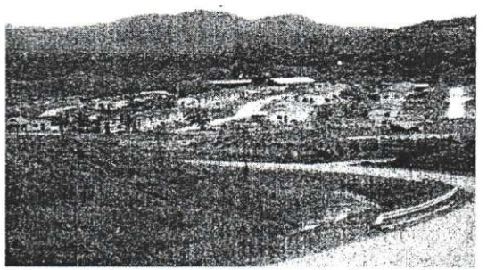
Figure 1. Developing house and infrastructures for participant in Pulau Banggi, Sabah.

allocated for agropolitan schemes almost RM960 million for land development of 16,903 hectares that managed by various government such as FELCRA<sup>4</sup>, KEDA<sup>5</sup>, agencies KESEDAR<sup>5</sup>, RISDA<sup>6</sup> and others. The private sector also involved with efforts to facilitate a farming business, such as sheep, corn, cocoa, herbs and chicken. Local universities also provide human capital while social institutions are involved in community programs such as 'rukun tetangga', etc. Among the areas involved are Pulau Banggi in Sabah, Tanjung Gahai in Pahang, Sik in Kedah, Gua Musang in Kelantan and a few more coming in the pipeline. Direct benefit from the implementation of this agropolitan approach can be seen from the increase of the average income of RM520 to RM1200 per month for each selected By participant. having the complete infrastructure facilities and utilities, the agropolitan population indirectly feels the impact of these changes.